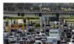
contactless toll system